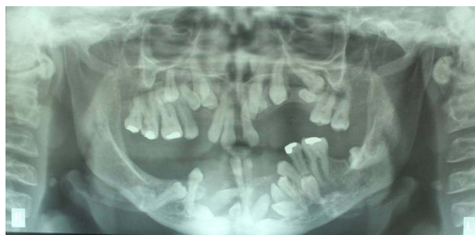
[Table/Fig-3]: Orthopantomogram shows multiple impacted teeth with associated two ill defined radiolucencies in parasymphiseal region of mandibular arch.